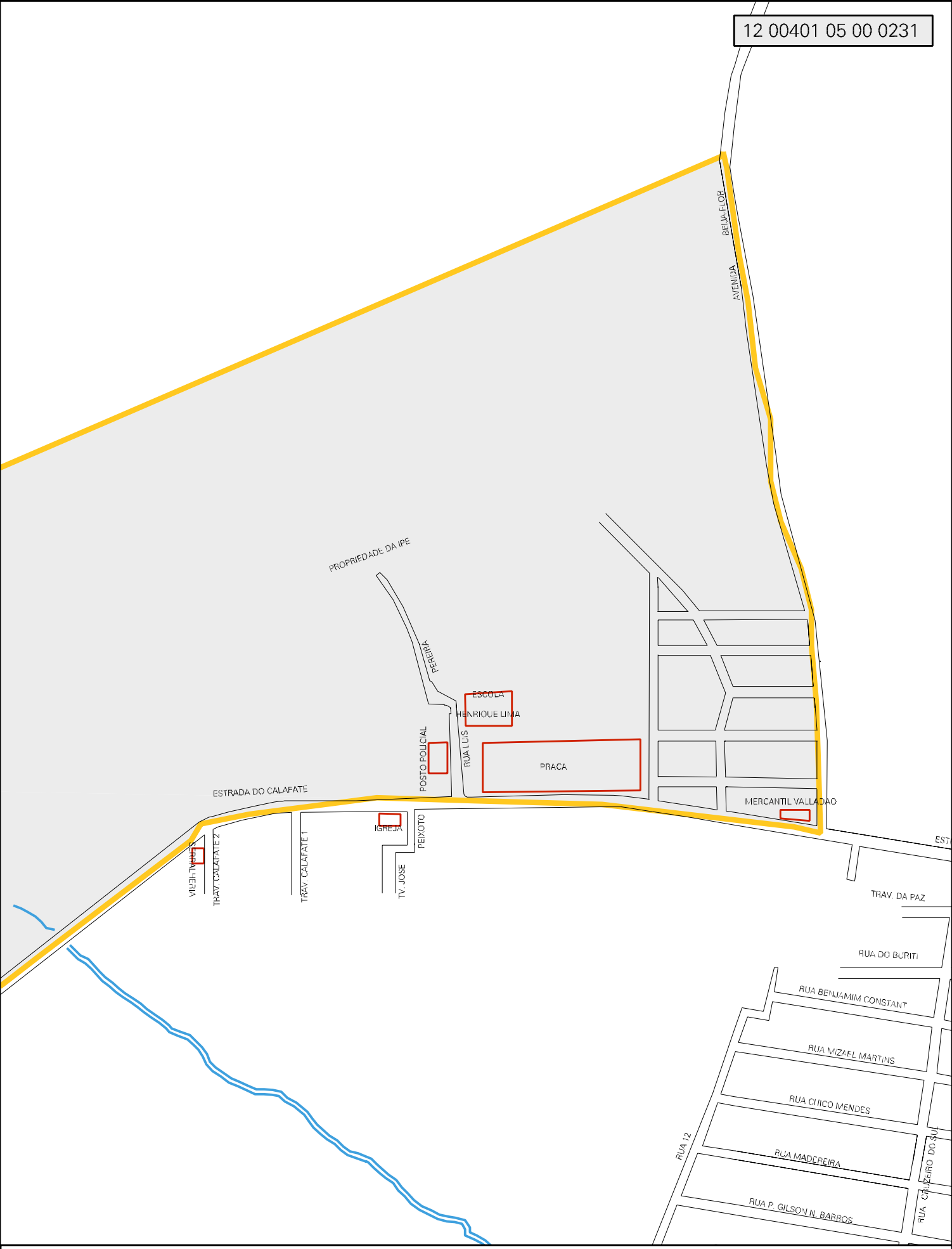
ESTADO DO ACRE MAPA DE SETOR URBANO - MSU ESCALA: 1 : 5285