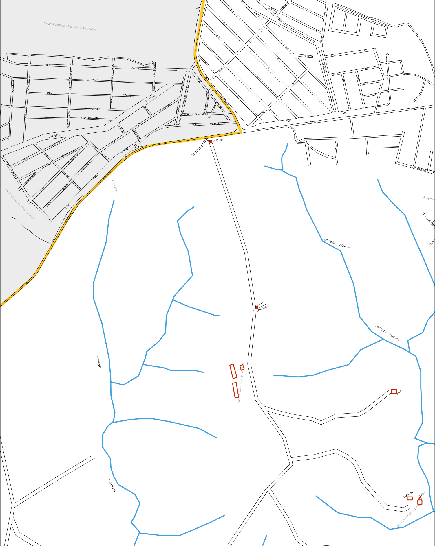
ESTADO DE MINAS GERAIS MAPA DE SETOR URBANO - MSU ESCALA: 1 : 11093