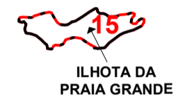
ILHOTA DA PRAIA GRANDE